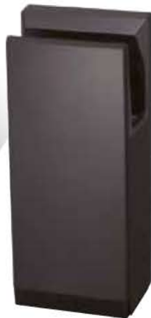
Model JT-SB216JSH - Heated - Black

All heated models come with both a high speed and standard setting to choose from.