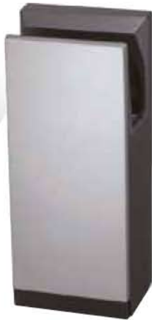
Model JT-SB216JSH - Heated - Silver.