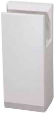
Model JT-SB216JSH - Heated - White. Model JT-SB216KSN Unheated - White.

Refined, ergonomic design available in three attractive colours - Select the unit that best matches your needs